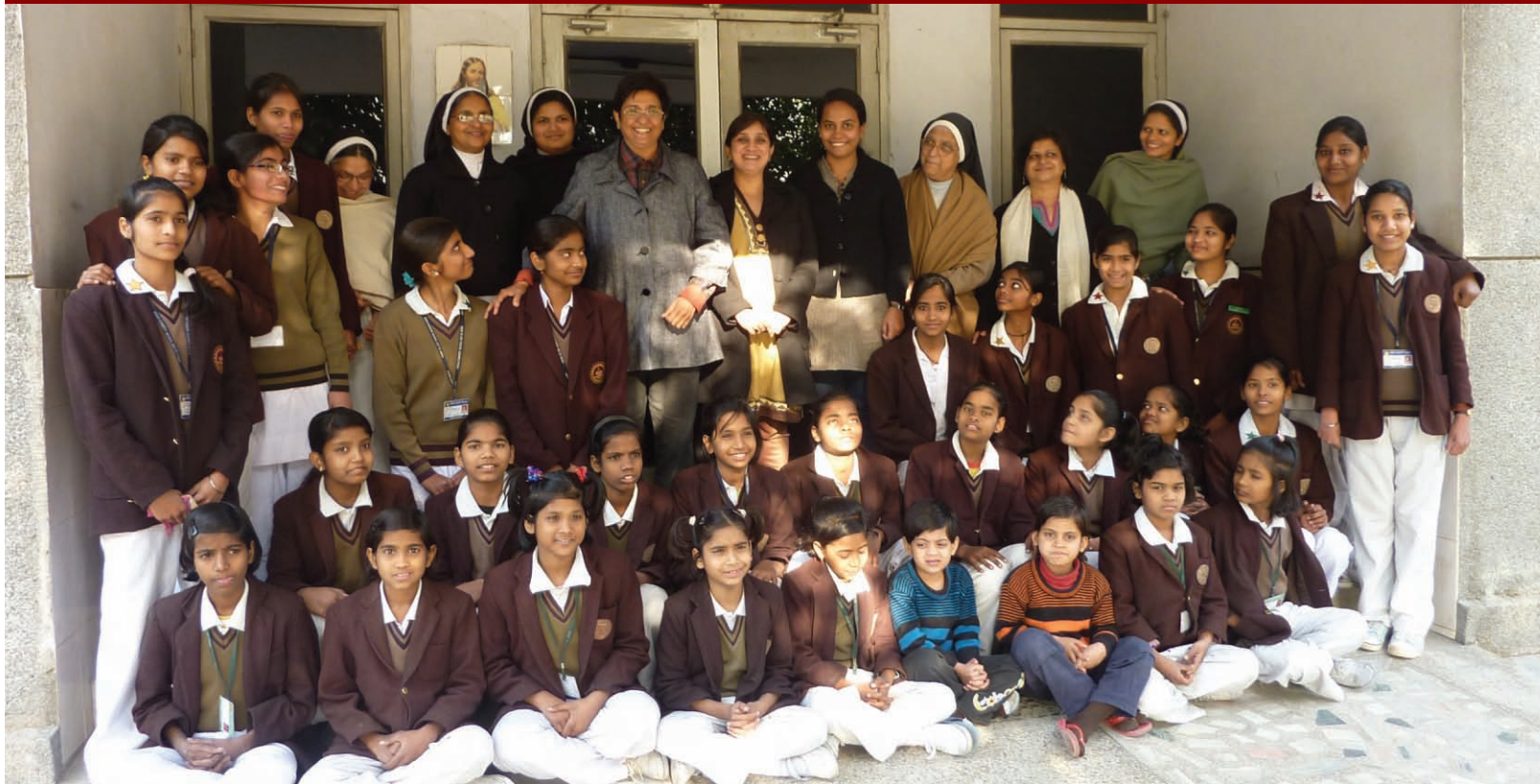
Dr Kiran Bedi with the girls of Assisi Convent School, Noida