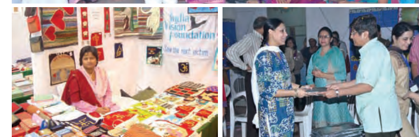
(Right) Certification distribution - Training in weaving