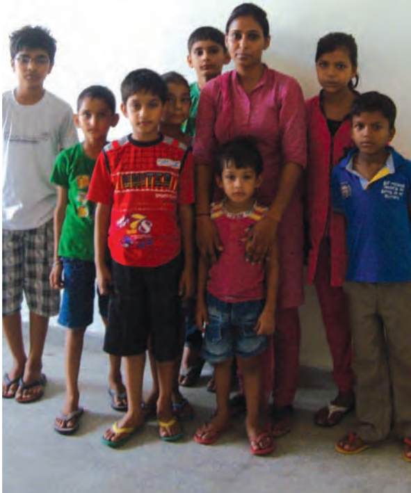
Children of the prison staff at Gurgaon India Police Center along with their trainer