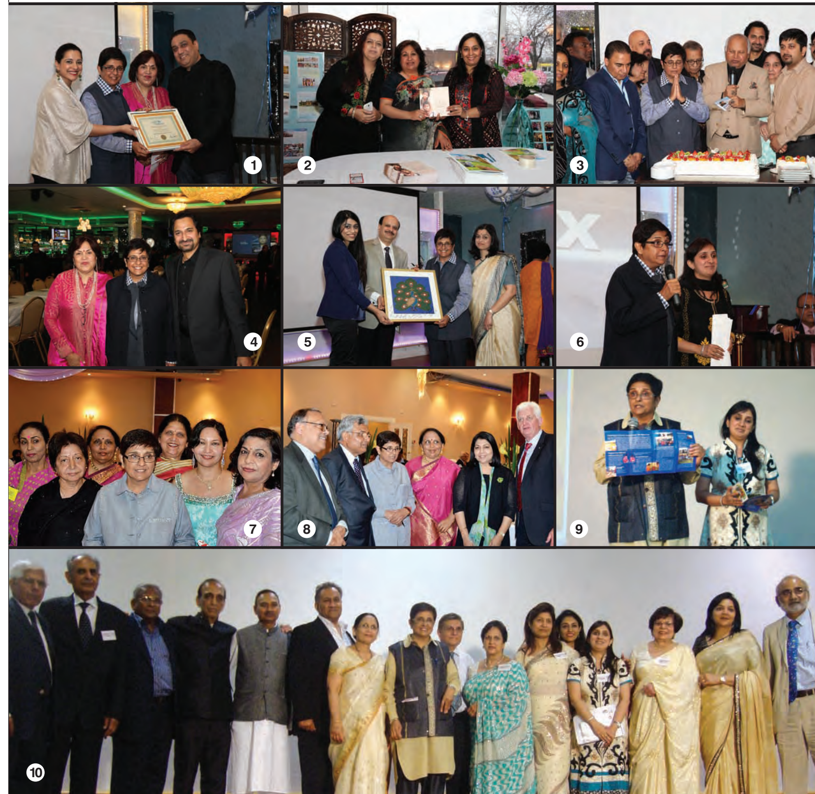
1-6 USA Event. 7-8 Australia Event. 9-10 UK Event