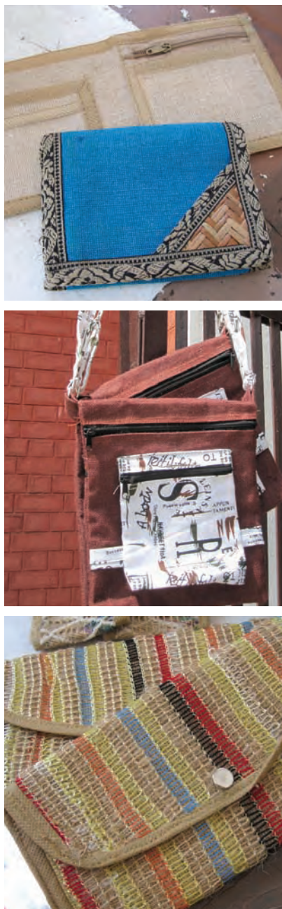
Top: Inmates trying their hand at the jute craft training machines. Right: Products created by the female inmates.