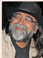
Prahlad Kakkar Creatives