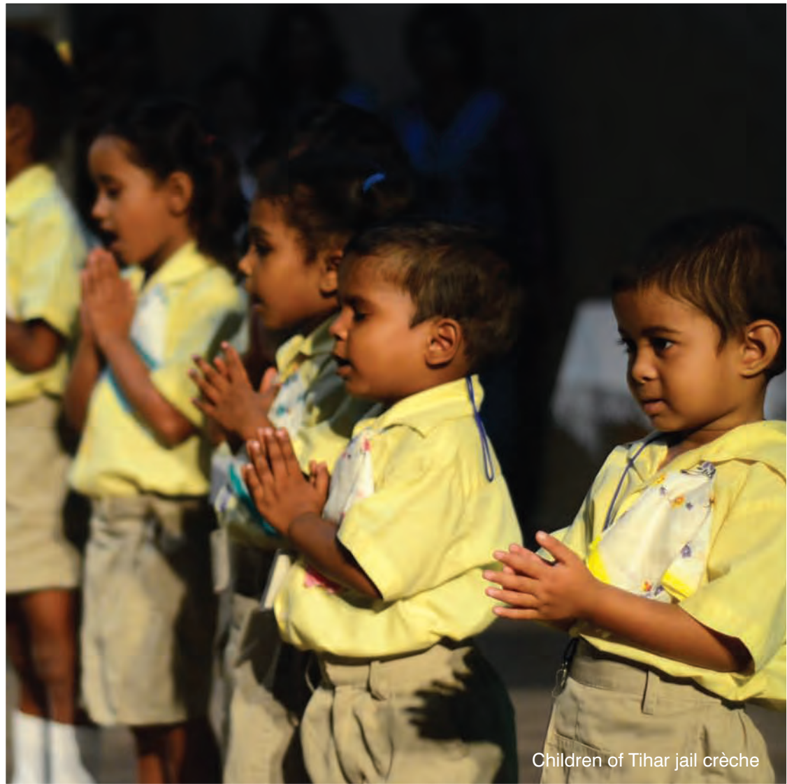
Children of Tihar jail crèche